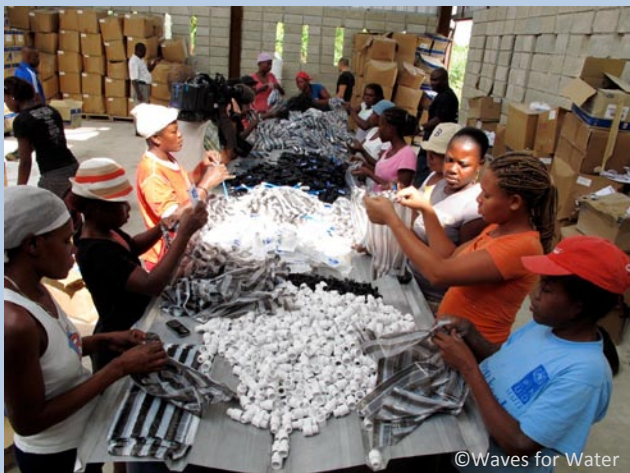
Assembly line in Haiti