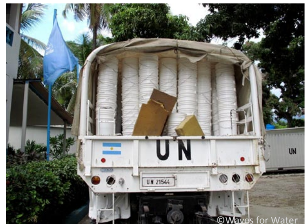
Filters delivered by the UN to combat Cholera in Haiti

You can find a Sawyer "Build your own emergency water kit" at many US retail stores such as Cabelas, Bass Pro Shop and Lowes.